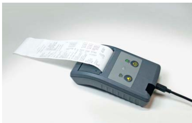
Portable report printer