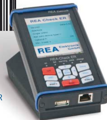
REA Check ER