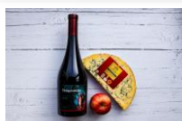
Wine & Food