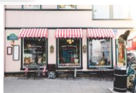
Small - Medium Enterprises