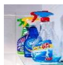
Chemicals & Solvents