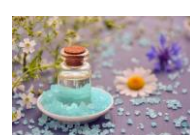
Cosmetics & Beauty

Reduce complexity, avoid obsolete labels, save time and money.